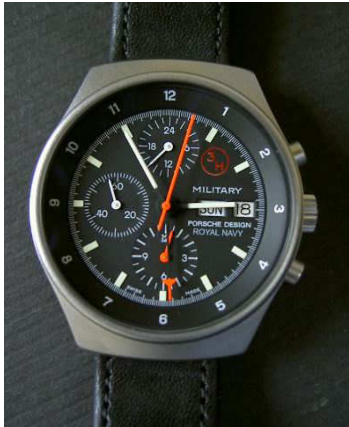
SWISS MILITARY - this particular variant features a unique olive-drab PVD coating: