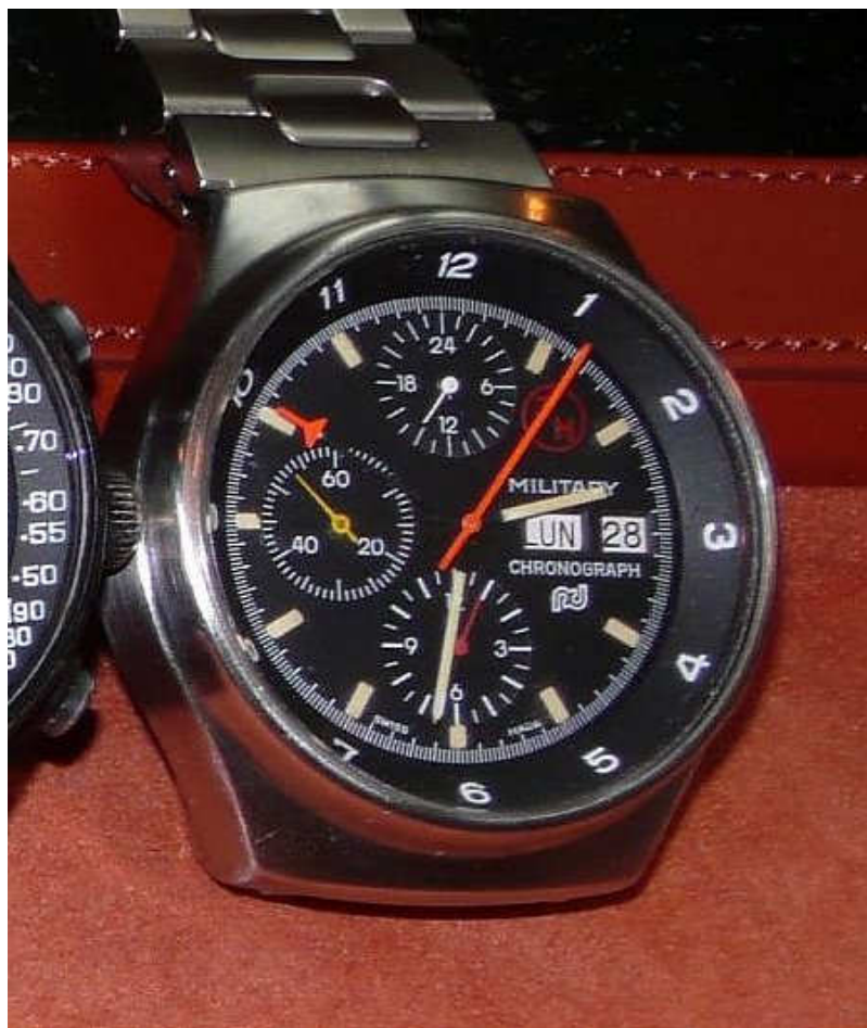
ORFINA SWISS - this one features the additional printing "by ORFINA" along with a swiss shield: