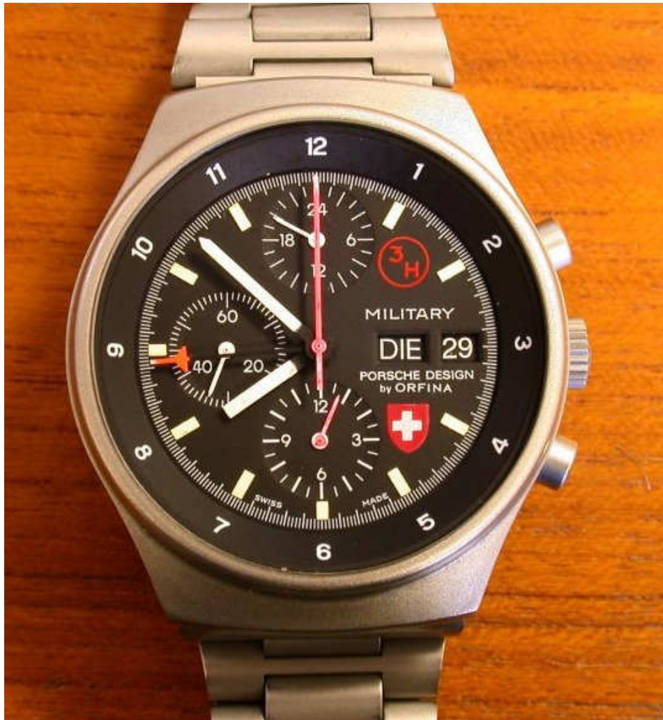
ORFINA MK-II - this one features the additional printing "by ORFINA" along with "MILITARY MK II" and two stars, a relocated red "3H" logo, and a tachymetric ring with red print: